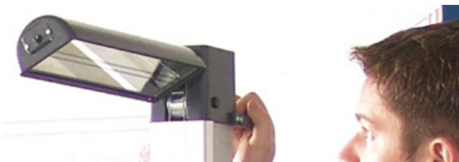
The unit is aligned with the vehicle by means of a mirror or, optionally, by using the laser pointer.